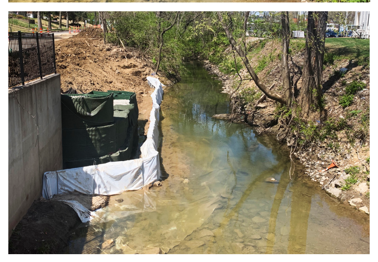
Muscle Wall is also an excellent solution for temporary flooding!