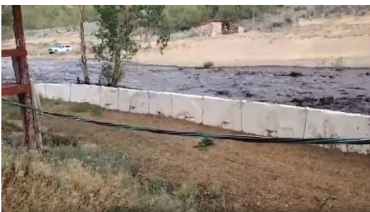
Muscle Wall used as perimeter protection to protect a homeowner's house and property from flash flooding.