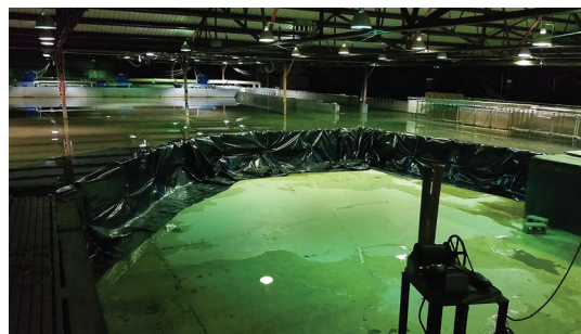
Images of testing conducted on Muscle Wall at the US Army Engineer Research and Development Center.