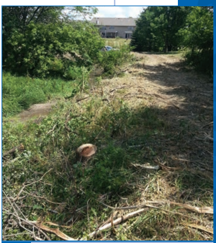
A portion of the stream and stream bank throughout the Greenbelt.