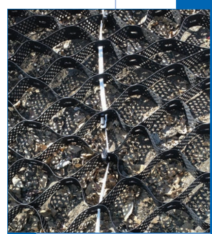
Note the support tendons distributing the load evenly through the section.