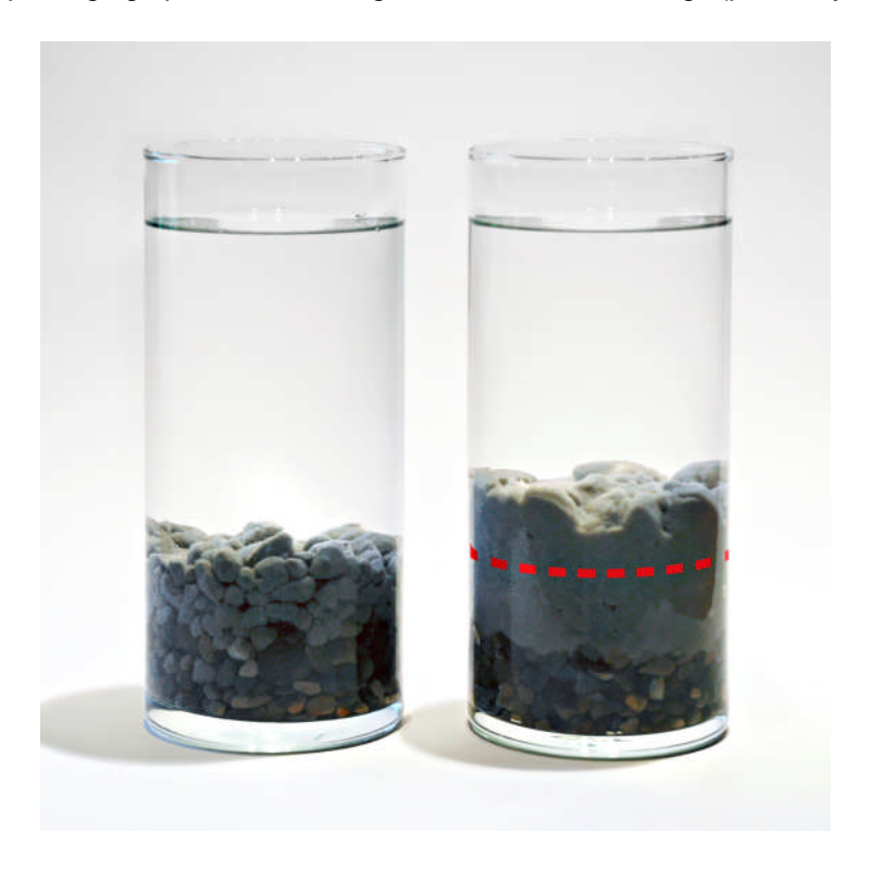
Figure 1. AquaBlok applied at 7-lbs/ft′ (~1" dry material thickness) atop ~1" layer of ordinary gravel. Time lapse: LEFT: immediately after inundation and RIGHT: 24 hours after inundation. Note original boundary between product and water (dashed red line) demonstrating swell/expansion of product over time.

AquaBlok, Ltd. • 3401 Glendale Ave. Suite 300 • Toledo, Ohio 43614 U.S.A. • (800) 688-2649 • www.aquablok.com