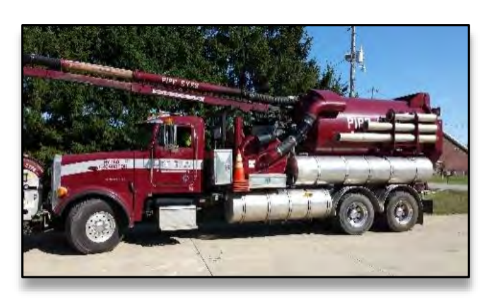
Combination Sewer Truck with 1,500 gallon water tank