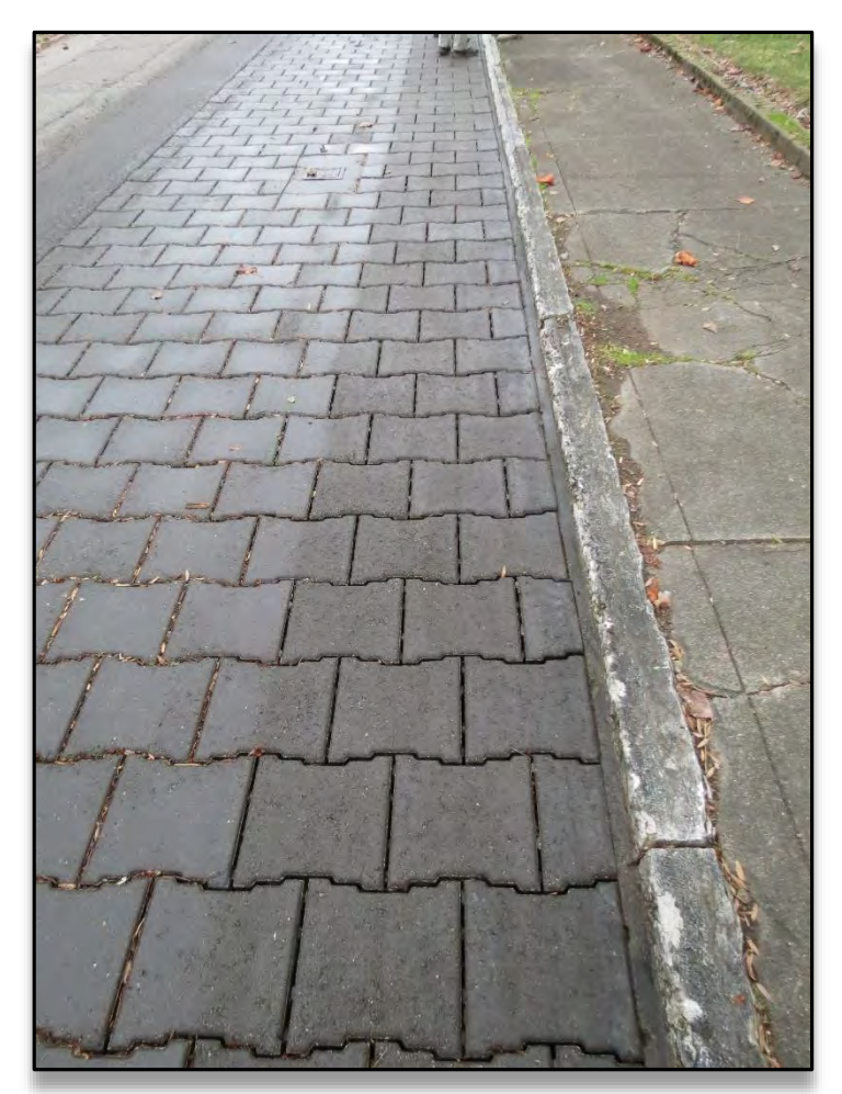
The 32" suction path is visible on the surface of the PaveDrain System after one pass of the Whirlwind.