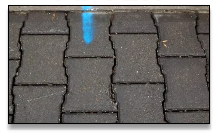
Two years of stormwater runoff from adjacent asphalt, mulched flower beds, flowering trees and residential lawns.