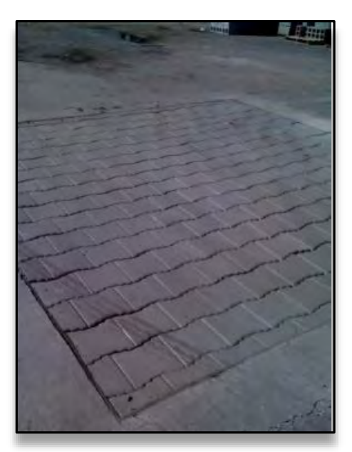
Q: Can the PaveDrain System be snow plowed with steel snow plow blade?

A: Yes. However, it should be noted that the edges of the block may be scored or slightly damaged by a steel blade (see below).