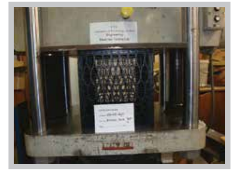
Unconfined Compression Test