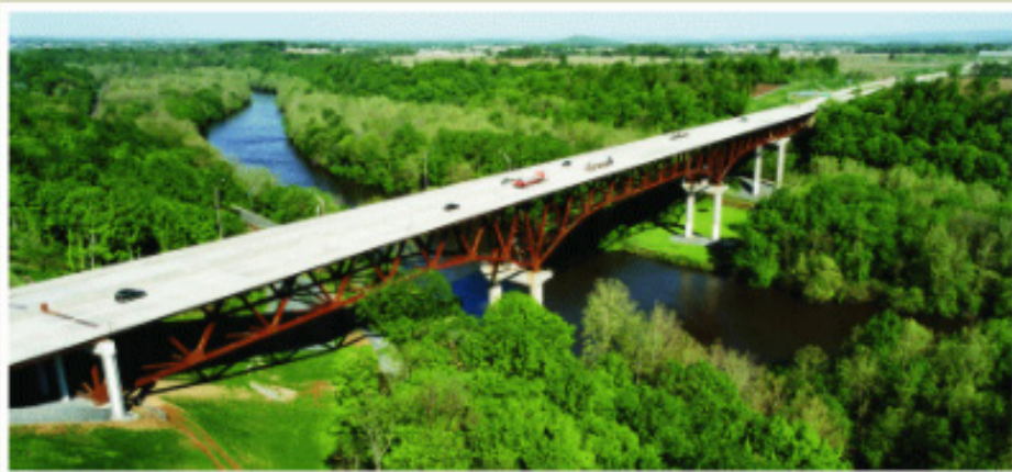
Gene Hartzell Memorial Bridge, Lehigh, PA – Versiflex™ HLMR Spherical Bearings