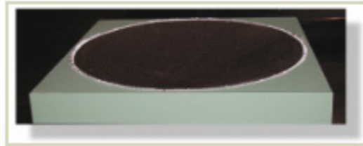
Concave Plate with Woven PTFE

Versiflex™ HLMR Spherical Bearing Assemblies are most commonly utilized at locations where very high vertical loads and/or large structural rotations are present.