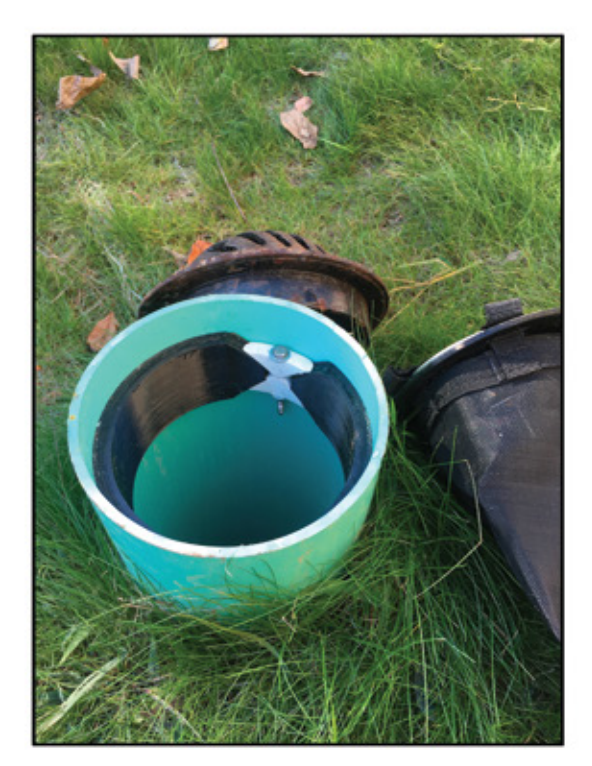
Beehive Filters all have a bypass/over flow built in as shown above.