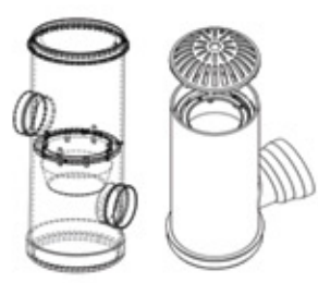
Beehive Filters adapt to a variety of drainage structures (above).

Fabco offers filtration options for a wide variety of drainage structures (Right).