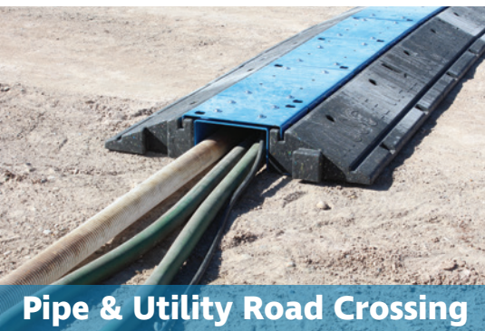
Pipe & Utility Road Crossing