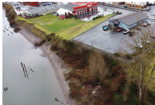
Before River Walk Installation w/ Massive Erosion

The Geoweb Soil Stabilization System prevents erosion by confining the infill material within its cellular structure (geocells), making it resistant to sheet flow and preventing scour on slope surfaces. The Geoweb system promotes vegetation growth, making it a long-term replacement for other expensive erosion solutions.