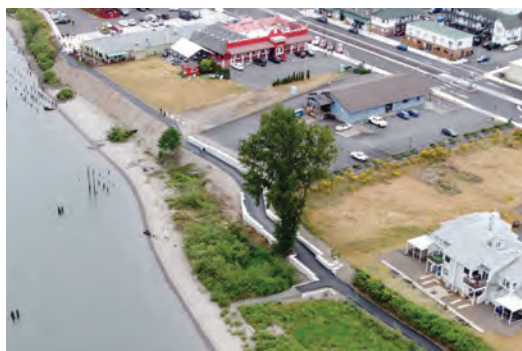
After River Walk Installation w/ Presto Geoweb Support