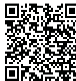
DSB Installation Sheet