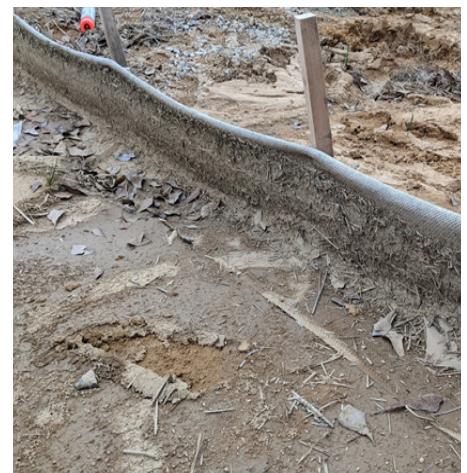
Shown Left to Right: Straw wattle deformation as degradation occurs, WattleFence in action under sediment-laden flows, WattleFence continued performance after multiple flow event.